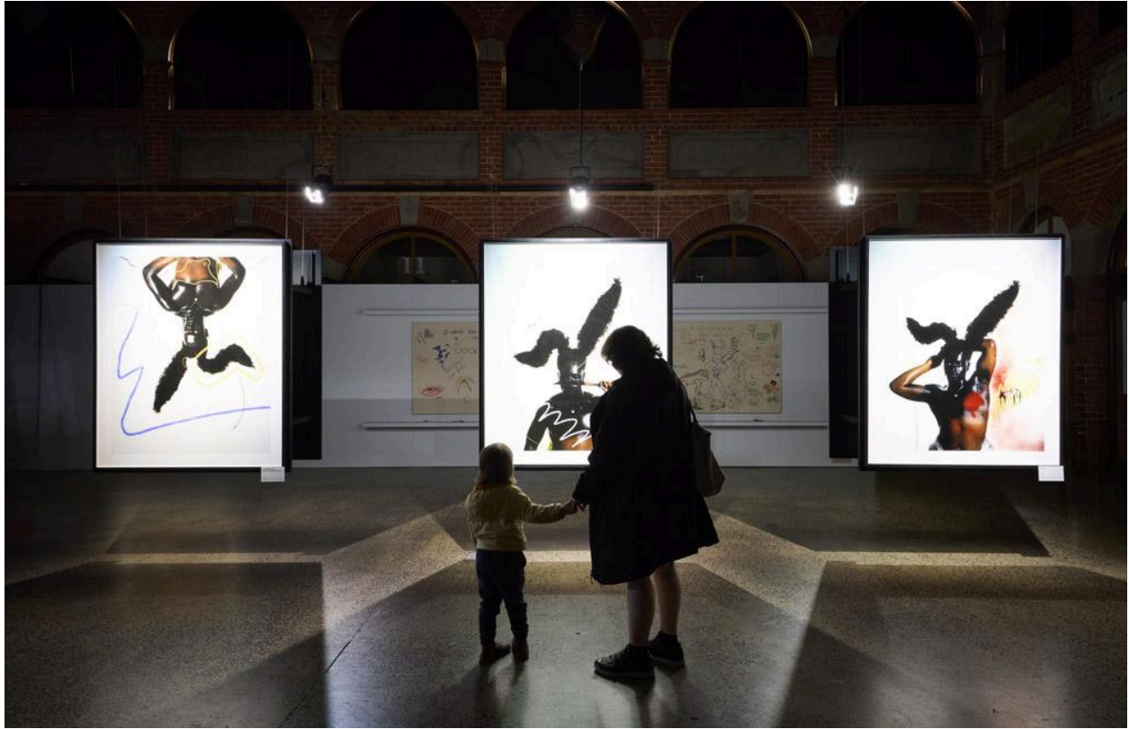
A photograph of Campbell Addy's 2025 exhibition I Love Campbell.

The Ballarat International Foto Biennale, or Ballarat Foto for short, is a major photography festival held every two years in Ballarat, Victoria.